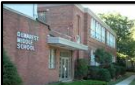
• Demarest Middle School • Demarest, NJ